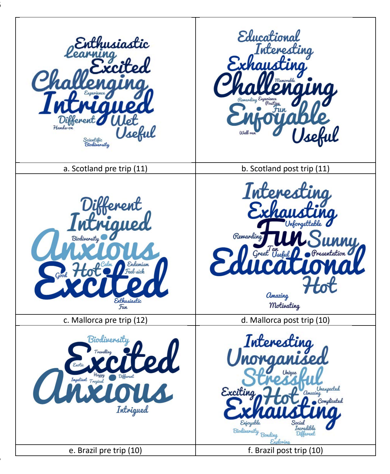
Figure 2. Word clouds capturing the views of students pre/post participation in the field trips. Larger font indicates number of responses. Within each of figures a-f words are sized to scale and directly comparable. Between figures words are not necessarily to scale and therefore not necessarily directly comparable, however the relative importance of words can be compared between figures.