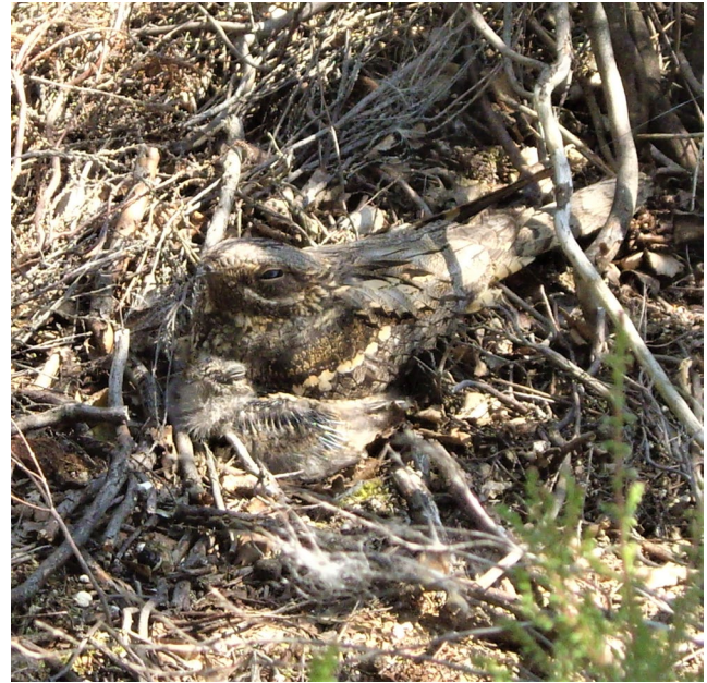
FIGURE 1 Adult female nightjar brooding one juvenile. Taken on Thorne Moor, South Yorkshire, June 2018 by Lucy Mitchell

To test for differences in home range size between sex, year, and availability of different habitat types, we used linear models in R (similar to Ofstad et al., 2019), where home range size (ha) was the dependent variable, and all habitat terms and year were used as fixed