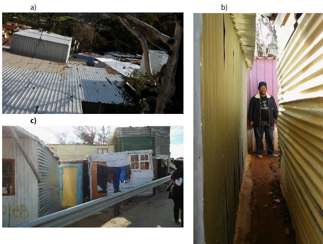
Figure 3: Imizamo Yethu informal settlement in Cape Town showing: a) close proximity of homes with roof structures possibly covering multiple households; b) narrow gaps between dwellings; and c) variety of building materials used in construction

government has delivered housing since 1994, an estimated backlog of 350,000 housing units remains (StatsSA, 2018). Much of the housing that has been delivered has reinforced the spatial marginalisation of economically deprived citizens, and has often been of mixed quality. The shortage and unsuitability of housing stock has meant that the number of people living within informal settlements and backyard dwellings continues to grow (Turok and Borel-Saladin, 2016). Whilst these settlements are not authorised by the government, their layout may be informally planned and locally governed. Some settlements have clear roads, walkways and gaps between homes, while others are very densely populated with narrow passages (Figure 3).