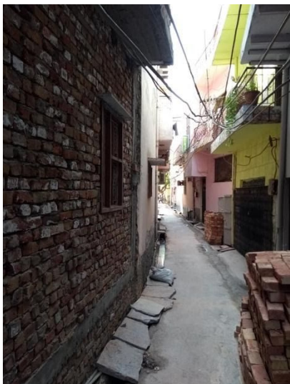
Figure SEQ Figure \* ARABIC 1: Narrow lane in Shabbad Muhamdar (left) and informal housing - Railway Colony (right)