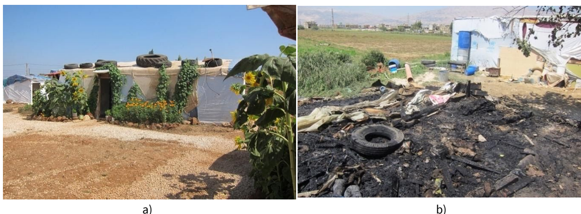
Figure 6: a) Tents in an informal refugee settlement in the Akkar region, where tyres are used to keep tents secure but contribute to a high level of fire loading and source of fuel; and b) the immediate aftermath of a tent fire in an informal refugees

The number of injuries caused by these fires is high. UNHCR data show 120 displaced persons with severe burns during 2015, with children under 5 being half of those injured. However, this is likely to be the “tip of the iceberg” as UNHCR only has the capacity to treat severe life-threatening cases; many more injuries, like smoke inhalation, non-fatal burns, and psychological trauma may be treated elsewhere or remain untreated (Zelkowitz et al., 2017). The fire fatality rate for Lebanon in 2017 was 1.48 fatalities/100,000/year (UK was 0.55) 11 . Fire fatalities in informal settlements are frequent, with 14 recorded deaths (12 children) between July and December 2017 (a rate of 11.2 fatalities/100,000/year) (Inter-Agency Coordination Lebanon et al., 2018). Refugees also face a loss of property to fire. The loss of documentation, in particular, can have stark consequences for refugees seeking socio-economic opportunities and assistance (Zelkowitz et al., 2017).