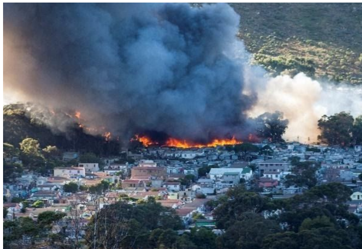
Figure 4: Fire spread through Imizamo Yethu in 2017

Fire risk is extremely high within informal settlements. As many as 10,000 people can be left homeless in a single fire (Pluke, 2017). In 2017, for example, a fire in Imizamo Yethu (Figure 4), left 2194 homes destroyed, despite the efforts of 176 firefighters (Kahanji et al., 2019). The disaster management and recovery from this incident cost the municipality over R100m ($7m) (Pluke, 2017); approximately the cost of 650 low-cost homes.