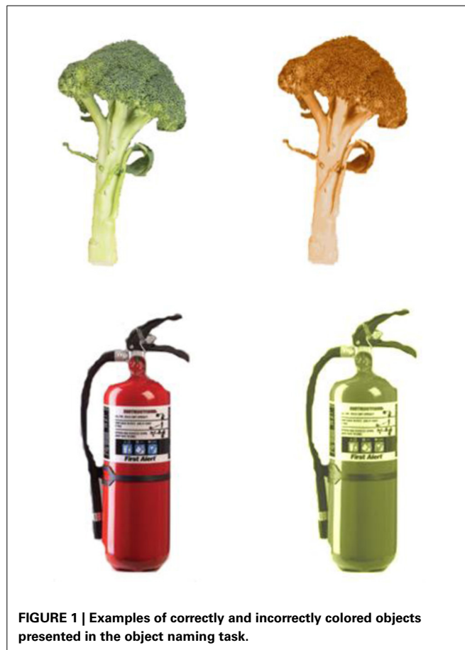
FIGURE 1 | Examples of correctly and incorrectly colored objects presented in the object naming task.

The experiment comprised two phases: (a) a study phase where correctly and incorrectly colored objects were named followed by (b) a test phase in which a lexical-semantic matching task