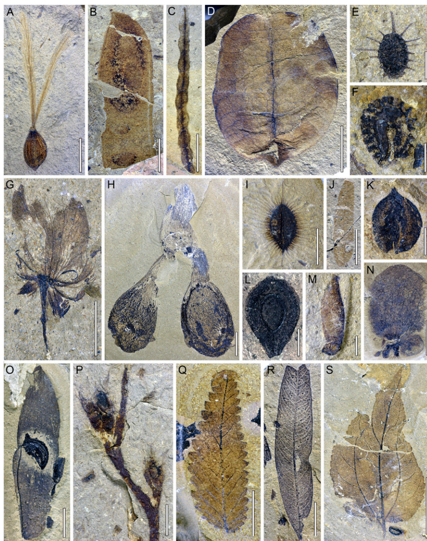
Fig. 2. Representative plant taxa in the Middle Eocene Jianglang flora from central Tibetan Plateau. (A) Lagokarpus tibetensis fruit (XZBGJL1-0383). (B and C) legume fruits (XZBGJL1-0012, XZBGJL3-0009). (D) Koelreuteria (Sapindaceae) capsular valves (XZBGJL5-0029). (E) Ceratophyllum (Ceratophyllaceae) achene (XZBGJL5-0545). (F) Stephania (Menispermaceae) endocarp (XZBGJL5-0524). (G) Unknown flower (XZBGJL1-0008). (H) cf Colocasia (Araceae) tubers (XZBGJL5-0231). (I) Illigera (Hernandiaceae) fruit (XZBGJL1-0003). (J) legume leaflet (XZBGJL5-0123). (K) Vitaceae seed (XZBGJL1-0018). (L) Asclepiadospermum marginatum (Apocynaceae) seed (XZBGJL5-0432). (M) Cedreleae (Meliaceae) seed (XZBGJL5-0034). (N) Limnobiophyllum (Araceae) whole plant (XZBGJL5-0177). (O) Ailanthus maximus (Simaroubaceae) samara (XZBGJL5-0007). (P) Cedrelospermum (Ulmaceae) young fruit-bearing branch (XZBGJL5-0033). (Q) Cedrelospermum (Ulmaceae) leaf (XZBGJL5-0533). (R) Myrtales leaf (XZBGJL5-0166). (S) Ziziphus (Rhamnaceae) leaf (XZBGJL1-0023). (Scale bars, 10 mm: A, C, D, H, N, O, R, S; 5 mm: B, G, I, J, P, Q; 2 mm: E, F, K–M.)

Tibet's Role for Global Biodiversity. The contribution of Tibet to global biodiversity in deep time has hitherto been overlooked due to a lack of fossil evidence. The Paleocene and early Eocene “redbeds” of the lower Niubao Formation indicate aridity, but the richness of plant species in the Jianglang flora evidences a diverse subtropical Shangri-La-like valley ecosystem along the BNS. This persisted in a modified form into the late Oligocene as shown by the Lunpola Basin biota (11–13, 15–18, 24). Significantly, these new floral discoveries show that central Tibet hosted a different plant diversity in deep time from that which exists