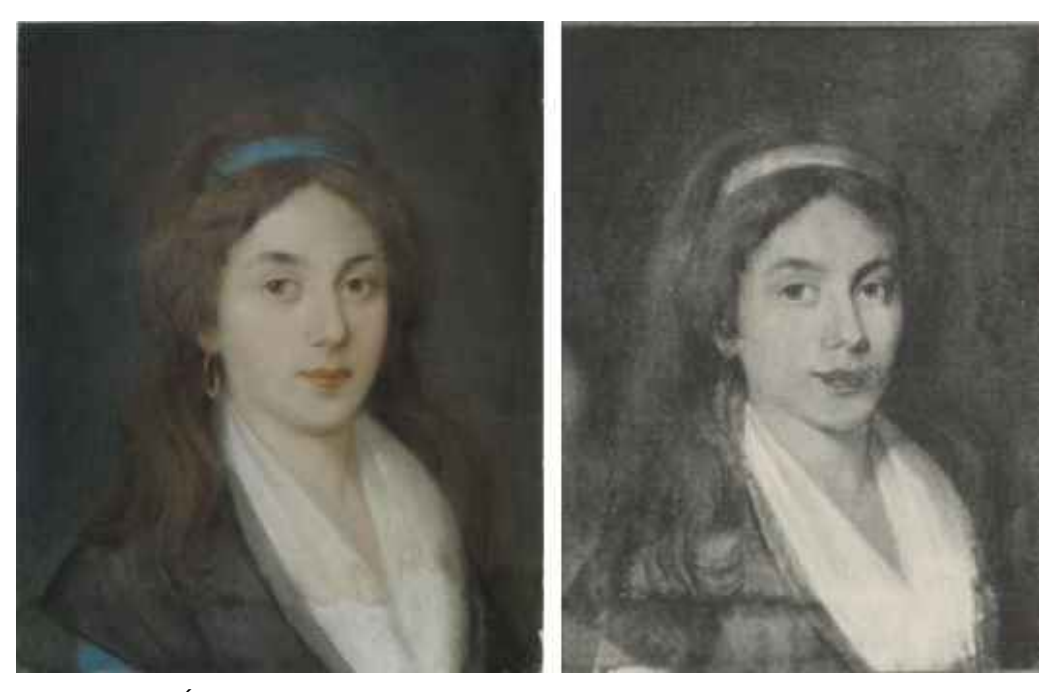
Figure 5a & 5b: Éléonore Duplay, pastel, possibly a self-portrait, Musée Carnavalet, Paris 5a: [Public domain], via Wikimedia Commons; 5b: from Buffenoir, Les portraits de Robespierre , 1910.

only seen a poor-quality photograph, like that in Hippolyte Buffenoir's Les por-traits de Robespierre (Buffenoir 1910, pl. 71).