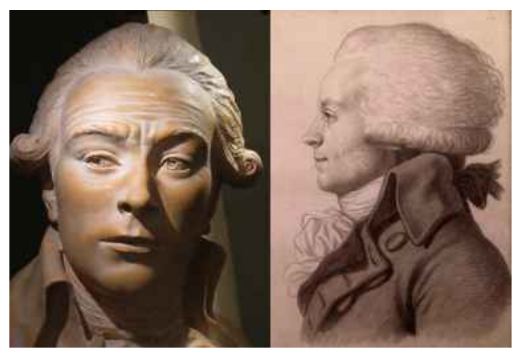
Figure 3 (left): Maximilien Robespierre by Claude-André Deseine, 1791, Plaster cast in the Conciergerie, Paris, of the original terracotta bust in the Musée de la Révolution Française, Vizille, Photograph by the author, May 2018.

Figure 4 (right): Maximilien Robespierre, physionotrace grand trait (traced directly from his profile) probably by Jean-Baptiste Fouquet, 1792, Musée de Versailles [Public domain], via Wikimedia Commons.