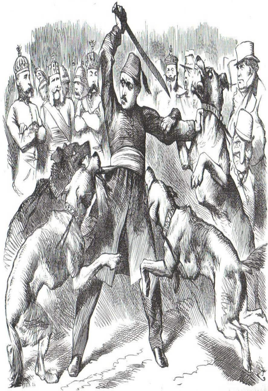
KEEPING THE RING.