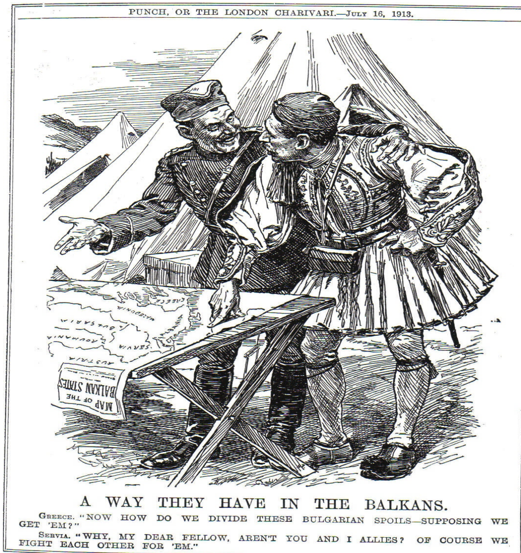
Figure 4.15.: 'A Way They Have in the Balkans', Punch (1913)

Although intra-Balkan antagonisms began to feature more frequently in Punch during the Second Balkan War, only on one occasion did the magazine suggest that the hostilities were somehow an indication of 'how things had always been done' in the region. Bernard Partridge's illustration 'A Way They Have in the Balkans', featured Serbian and Greek soldiers discussing how they would divide the Macedonian lands in the case that they were victorious against Bulgaria. The Serbian character stated that 'of course we fight each other' for them. 663