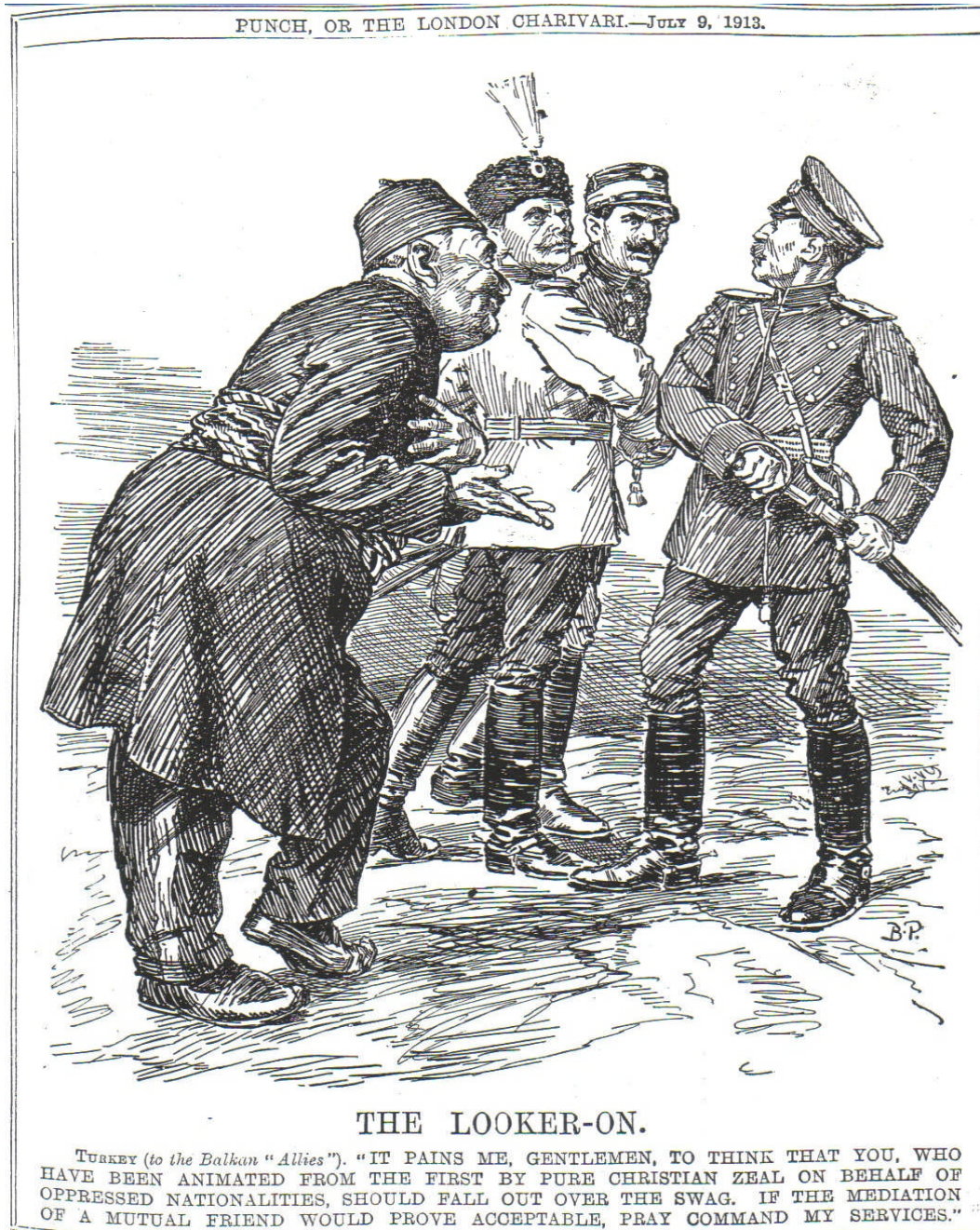
Figure 4.14.: 'The Looker-On', Punch (1913)

Christians in Macedonia and Serbia's historical homeland in Kosovo, while, according to Misha Glenny, the 'real aims were coldly strategic and expansionist'. 662