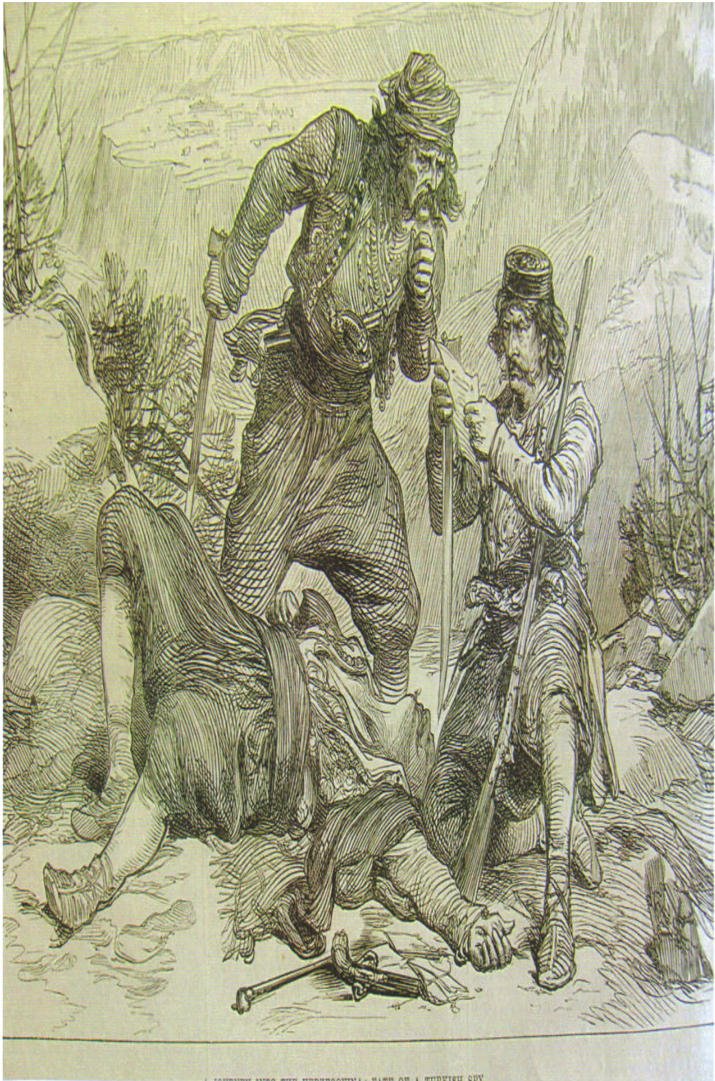
Figure 4.10.: 'Fate of a Turkish Spy', The Illustrated London News (1876)