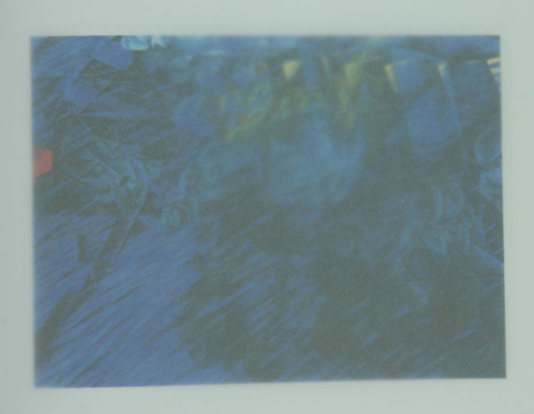
Umberto Boccioni States of Mind II: Those who Go (1911).