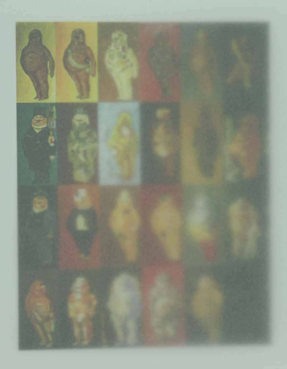
Victor Brauner L'étrange cas de Monsieur K (fragment) (1934).