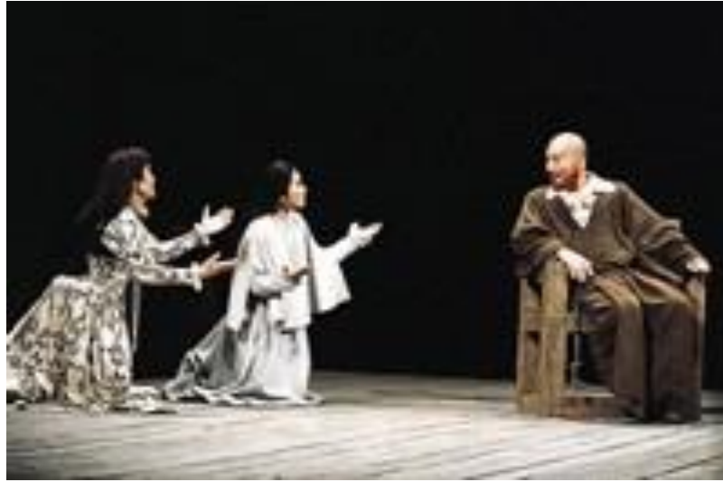
Figure 5 A scene in Qing jun ru weng , produced by the Beijing People's Art Theatre, 1981.

around the Friar's neck. Buddhism is definitely incompatible with such scenographic referents.