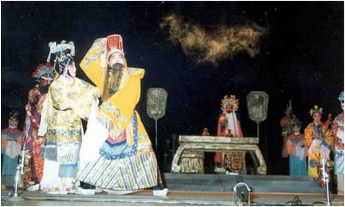
Figure 13 Macbeth (Ma Pei) recoils with fear during the Banquet scene. The Ghost of Du Ge (Banquo) is behind the table. kunju Blood-stained Hands/Macbeth (1986).

In addition to the banquet scene, Lady Macbeth’s sleepwalking scene—a brief scene in the original—is markedly elaborated and transformed into a spectacular and most memorable ghost scene. The frightful ghosts of Duncan, Banquo, Lady Macduff (who is also Lady Macbeth’s sister in the adaptation), and a parrot (whose neck was earlier wrung by Lady Macbeth for revealing the crime) each emerge from a darkened background, assaulting Lady Macbeth not only verbally but also physically. She scoffs at some and begs others for pardon, but all to no avail, as the avenging ghosts together chase her around the stage, waving their sword or shuixiu 水袖 (“water sleeves”, long white silk extensions of regular sleeves, conventional costume in traditional opera) 491 and breathing fire, demanding that she surrender her life. After a prolonged struggle—performed with superb physical movement and marvelous manipulation of four-foot-long water sleeves set to clamorous percussive beats—Lady Macbeth collapses in the end, literally beaten to death by the ghosts.