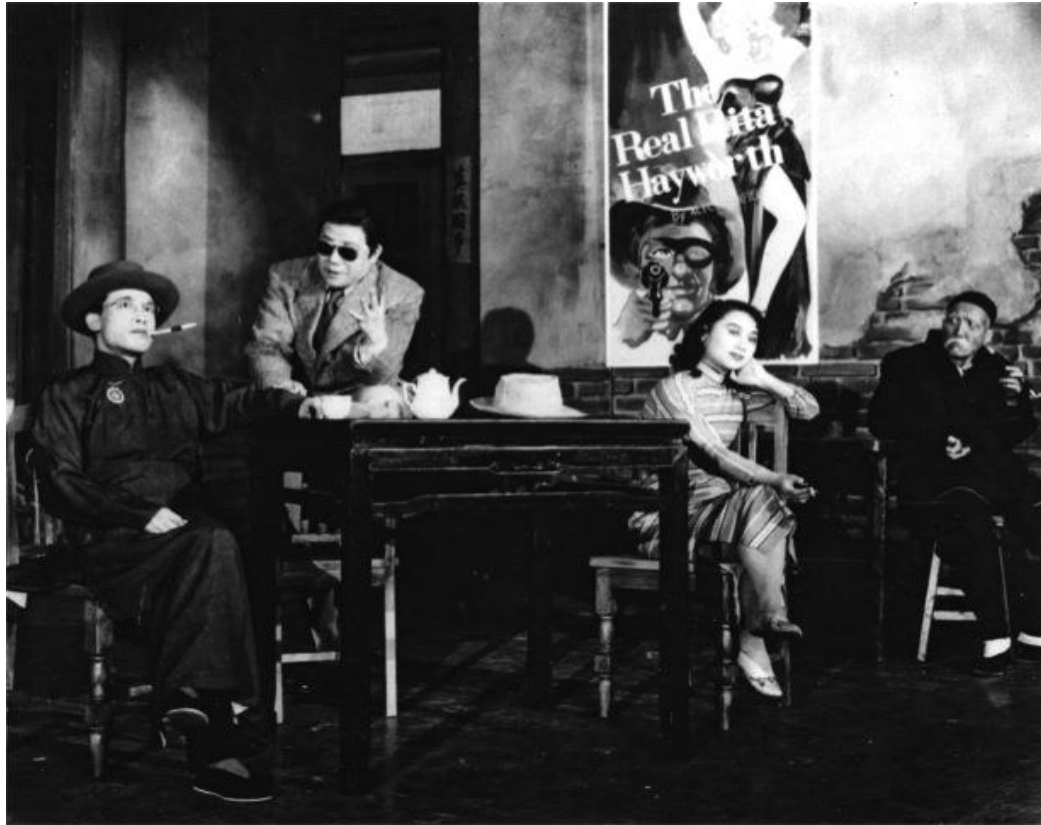
Figure 3 Ying Ruocheng as Liu Mazi Jr. in the 1979 revival of Teahouse.

In 1983, Arthur Miller and Ying collaborated on staging Miller's Death of a Salesman in Beijing. Ying translated the play, Arthur Miller directed it, and Ying played the part of Willy Loman. Ying also worked as Miller's interpreter and assistant director. Ying reworked the language to attune the conversations more to the style of the Beijing People's Art Theatre — a talent that impressed Miller immensely. Miller commented during his work in Beijing: 'It is surprising that I can follow each line and know the end of each idea, and I know where the actors are at every second; I know them by the rhythms of the translation.' 289 This Chinese production of Death of a Salesman opened on May 7, 1983 at the Beijing People's Art Theatre, and played continuously to packed houses through the autumn. The success of the production led to a breakthrough in Chinese theatre in the 1980s. Ying's interpretation of Loman, the tired but tireless salesman who would do anything and sacrifice himself for his sons, brought tears and resounding ovations from theatregoers. The flawed hero and moral ambiguities stood in sharp contrast to the morality tales typical of China's official theatre at the time. The story of a family