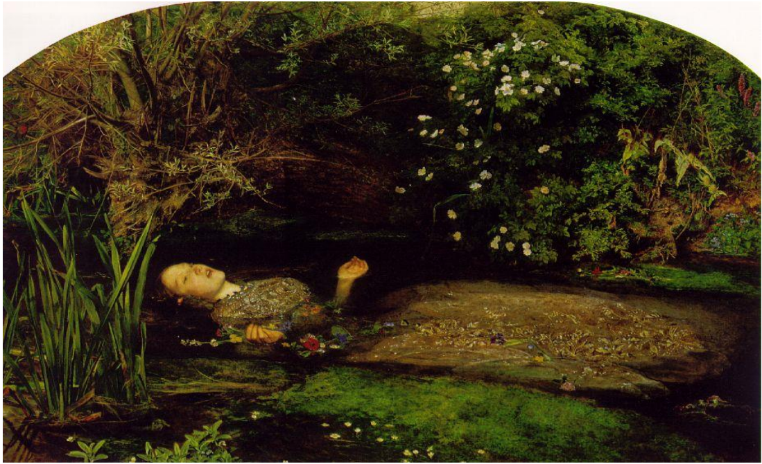
Figure 20 Ophelia, a painting by British artist Sir John Everett Millais, completed between 1851 and 1852. It is held in the Tate Britain in London. It depicts Ophelia, a character from William Shakespeare's play Hamlet , singing before she drowns in a river in Denmark.