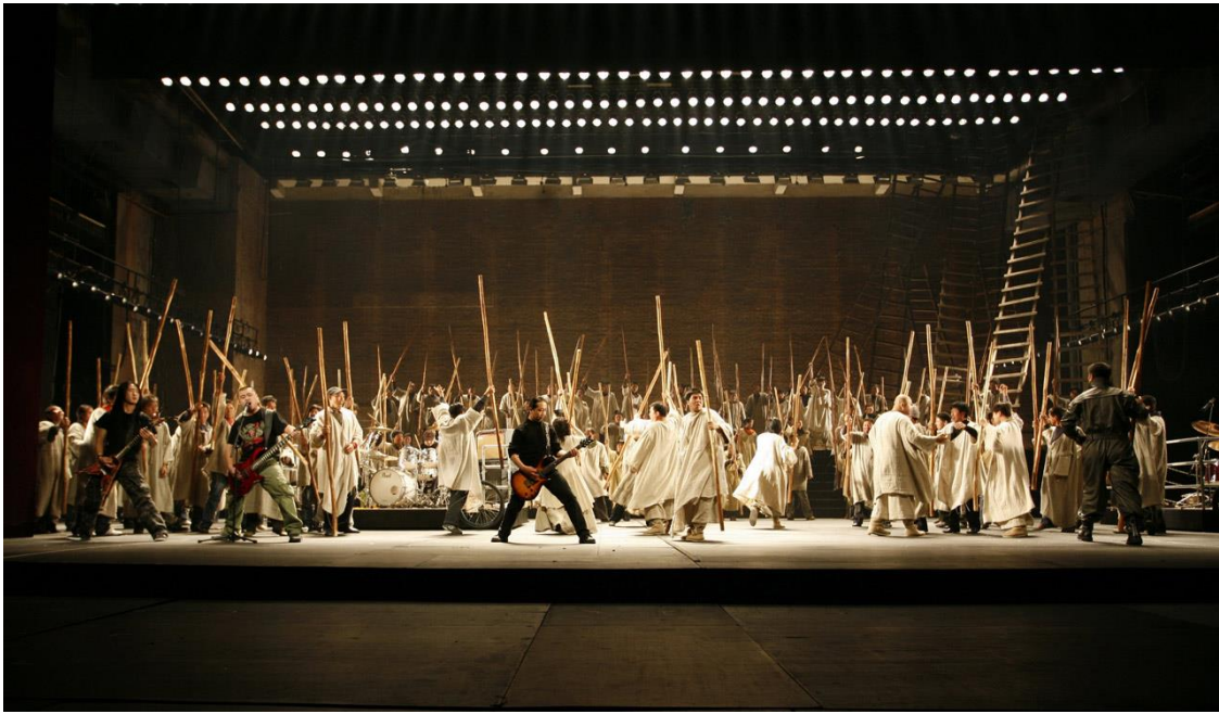
Figure 7 The Tragedy of Coriolanus by the Beijing People's Art Theatre, Edinburgh International Festival 2013.

The production opened with the hungry plebeians ‘with staves, clubs, and other weapons’ (1.1.1) rising up against the Roman patricians for the mounting price of grain. In the performances in China, Lin recruited a hundred migrant workers, including plasterers, cooks, guards, and so on, to play the plebeians, clearly placing Roman history in the context of China today. The migrant workers, wearing sackcloth tunics that could barely cover their work clothes, struck audiences as ‘the most authentic “people”, their shy, embarrassed, flabbergasted expressions not meant to be dramatic [...] these non-professionals stand for commonality not to be ignored’. 385 The hybridity of classic and modern struck the audience immediately as the rioting Roman plebeians were accompanied by three guitarists rocking and rolling onto the stage (See Figure 7). The guitar players, who were members of two heavy metal bands, stood out of the enacted Roman commonalty with their T-shirts, long hair and black clothing. In spite of the perceivable discrepancy between them and the rest of the cast, they made an indispensable part of the performance. The noisy music was not only a signification of rebellion, but also a symbolic voice of the angry crowds. With the first citizen asking to make an announcement, the performance of the three guitarists ended. ‘You are all resolved [rather] to die than to famish?’ (1.1.3), the first