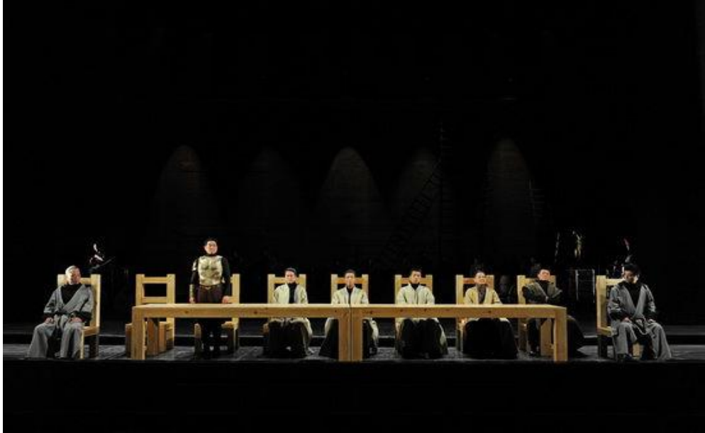
Figure 8 The Apron Stage in The Tragedy of Coriolanus , dir. by Lin Zhaohua, Edinburgh International Festival 2013.

manner of abstract painting. 398 While leaving room for the audience to reflect upon what they perceived, the assumptive nature of Lin's stage produced spatial metaphors to serve the purposes of his adaptation.