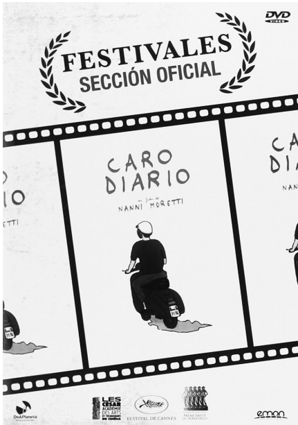
Poster: Nano Moretti, Caro Diario (1993)

which we can see the record having an existence.