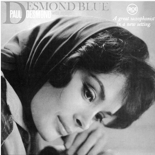
Record cover: Paul Desmond, Desmond Blue (1961)

face, lit in soft pastel covers, looking pensive but relaxed. The whole imagery of the cover emphasises not the musicianship of the performers or the dynamism of the music. Instead it presents a subtle idea about listening instead, by presenting a figure whose demeanour suggests a listening act that is both relaxed and pleasurable. But at the same time, the kind of musical setting Desmond Blue presents is one that, seen from a certain point of view, is fraught with a certain danger. Take this review of the reissue in Jazz Times :