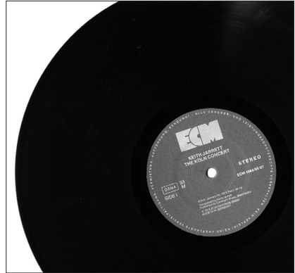
Keith Jarrett, The Köln Concert (1975)