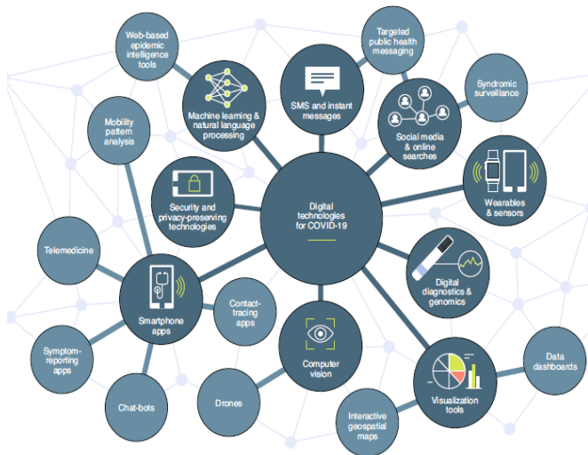
Fig. 1. Digital Technologies Applications in Public Health for Pandemic Management [12]

Lately, the world has witnessed accelerated development and innovative use of digital technologies in the fight against disease pandemics [10], [12]. The Covid-19 pandemic has equally provided evidence that the future of public health is tending towards integrated digital innovations. In Figure 1, a conceptual summary of several disparate digital technologies, social computing and data processing approaches that have played prominent roles in enabling easy and effective management of the global Covid-19 pandemic is presented [13]. Such techno-driven systems and approaches include but are not limited to GPS-enabled drones for screening, surveillance, disinfection and delivery of medical supplies, computer vision, automated contact tracing apps, security and privacy-preserving technologies, telemedicine, disease detection wearables and sensors, live casualties reporting apps and user-support mobile applications among others [12], [14], [15].