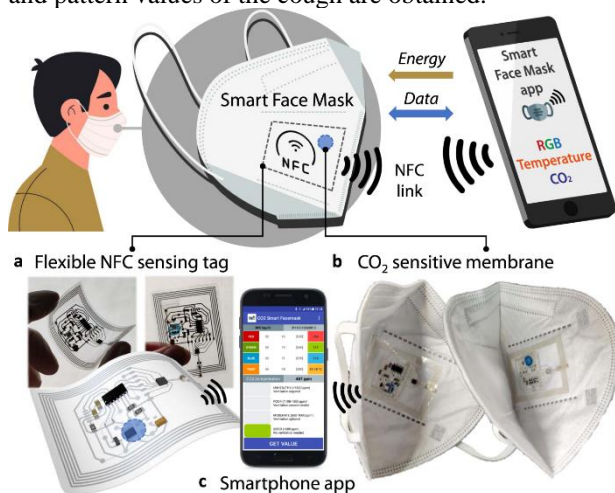
Fig. 3. A sample Architecture of a SFM with CO 2 monitoring capability (a) its NFC sensing tag (b) its CO 2 sensing layer (c) its smartphone application for support [30]

In this section, design methods, technologies and architectures of some emerging smart face masks are discussed. In order to monitor the breathing conditions of people in real time in a pandemic situation, [29] designed a self-powered SFM from two ultrathin Au/parylene/Teflon AF films pressure sensors with a thickness of \approx 5.5 (m) and a weight of \approx 4.5 mg. Its corona charging is fitted with a Dongwen DW-N503-4ACD2 or DW-P503-4ACD2 power source, a ground electrode and a corona needle. The SFM possesses high electrostatic induction efficiency and is readily sensitive to breathing airflow; however, it is non air permeable. In the work of [17] Zhu et al., application of harmonic sensors in the remote sensing of liquid levels, mechanical cracks, vital signs, humidity and so on was extended to cough detection and monitoring in Covid-19 situations. The authors proposes a wireless SFM based on a lightweight harmonic sensor with capability for continuous and rapid monitoring of cough associated with Covid-19. The smart mask design is built on a passive harmonic tag with a lumped element-based frequency multiplier, a meander-line antenna operating at 1.5 GHz for generating interrogation signals to the wearer and an inverted-F antenna operating at 3.0 GHz and generates time-series information from which the frequency and pattern values of the cough are obtained.