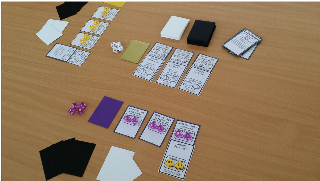
Figure 3. Check It Out! being played

effect of this blocking behaviour was that the time taken to play a game was extended and became unpredictable, so the decision was made to make the game a cooperative one. This demonstrates the potential detrimental effect that undesirable emergent behaviour could have on students achieving learning outcomes.