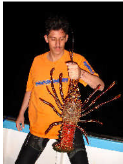
Spiny Lobster (red)