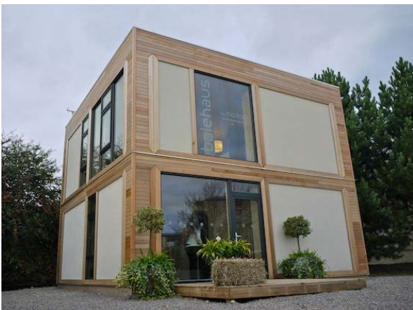
Figure 3 Modcell’s Balehaus@Bath 8

This company was deliberately system building, translating ‘deep green’ materials to the mainstream, but at the same time accommodating modern building practices of low-skill requirements, easy and quick construction and modern aesthetics, as well as consumer expectations about housing appearance. Thus niche practices can be translated to the mainstream, albeit incorporating significant modifications. Figures 2 and 3 illustrate the diversity of straw bale building styles which can arise from the same basic technology.