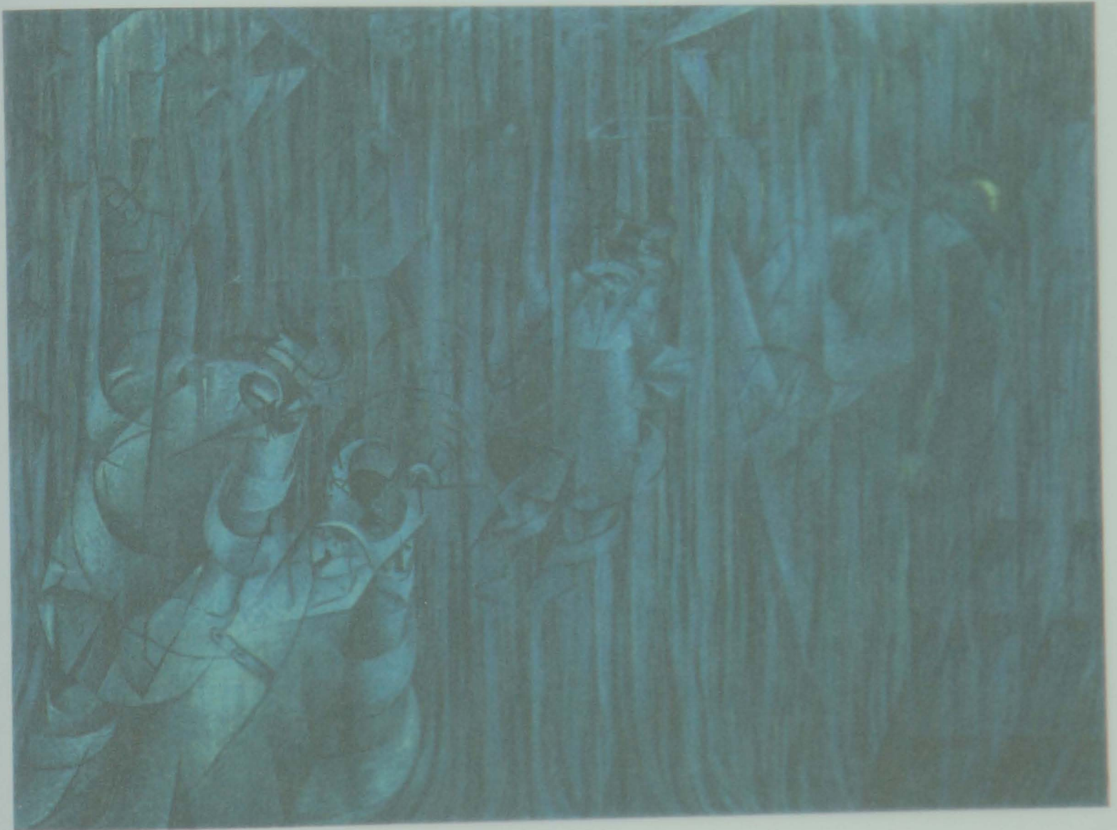
Umberto Boccioni States of Mind II: Those who Stay (1911).