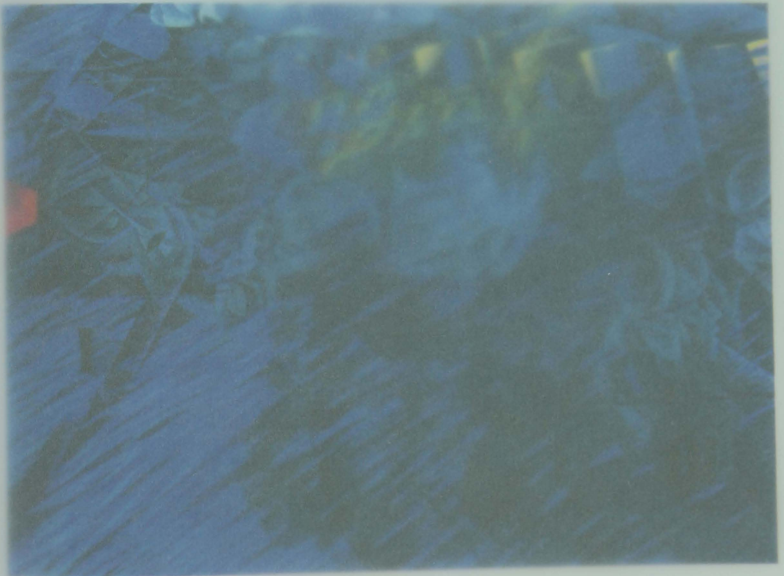
Umberto Boccioni States of Mind II: Those who Go (1911).