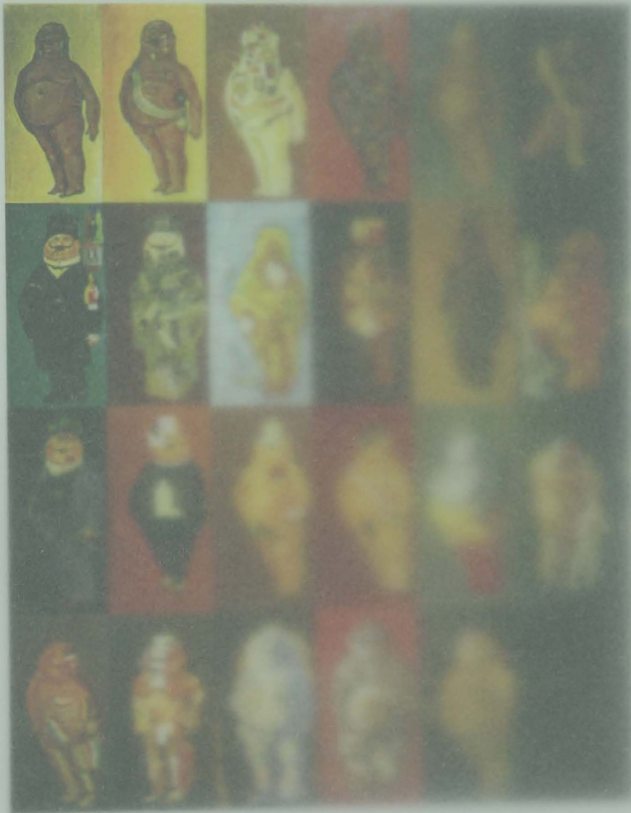
Victor Brauner L'Étrange cas de Monsieur K (fragment) (1934).