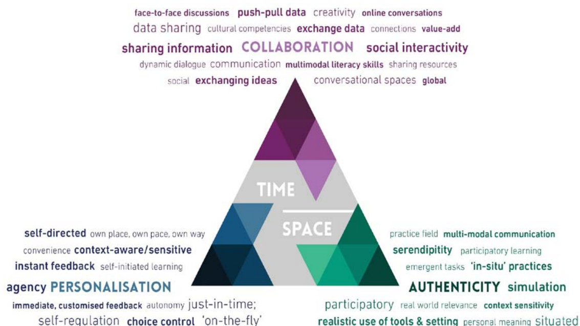
Figure 3. Word clouds relating to the three constructs of our Mobile Pedagogy Framework (MPF)

environment, and sharing resources through rich collaborative tasks (Wang & Shen, 2012). Figure 3 shows ‘word clouds’ created using frequently appearing terms associated with each of the three constructs from our previous papers (e.g. Kearney et al., 2012).